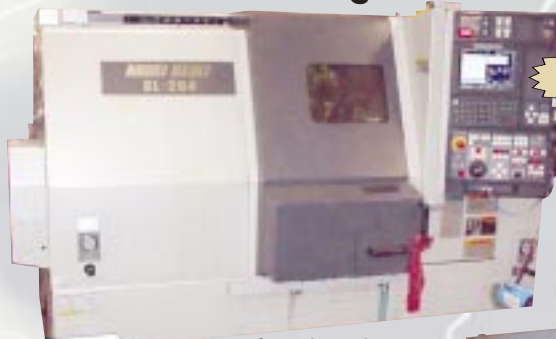
MORI SEIKI SL-204 CNC Turning Center