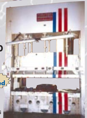
600 Ton PACIFIC Model 600 D10-60 Hydraulic Press