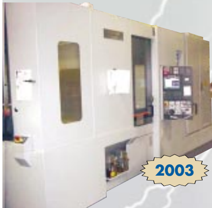
MORI SEIKI NH 5000/40 Horizontal Machining Center

BLOW OUT PRICES See Specially Marked Items Inside