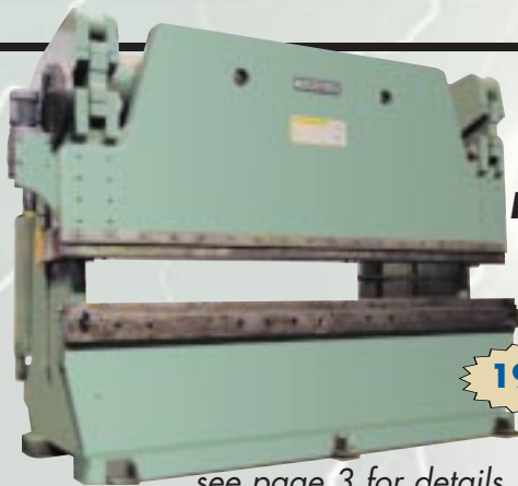
400 Ton ACCURPRESS Model 740012 CNC Press Brake