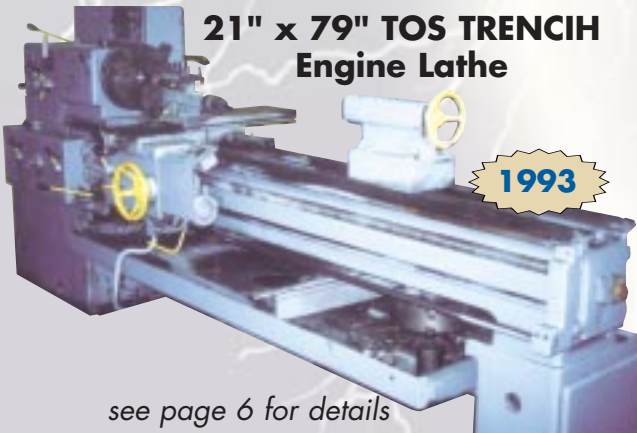
21" x 79" TOS TRENCH Engine Lathe